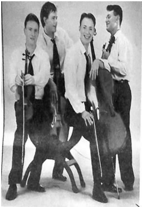
Jerusalem String Quartet